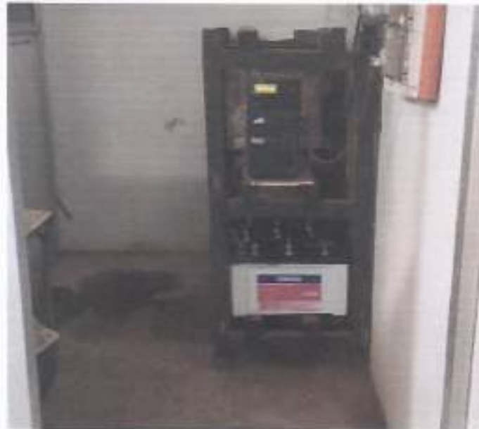
Next to TX HOD