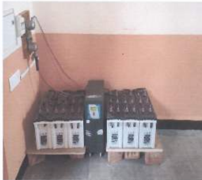
Common Computer Centre

[Handwritten Signature] PRINCIPAL R.V.K.S.R. Vastred Rural Polytechnic GULEDGUDU